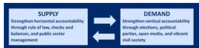
Figure 1. Supply & Demand in Anticorruption Initiatives

Through these many channels, accountability reforms strengthen institutions in government and society and foster structured competition in politics and the economy.