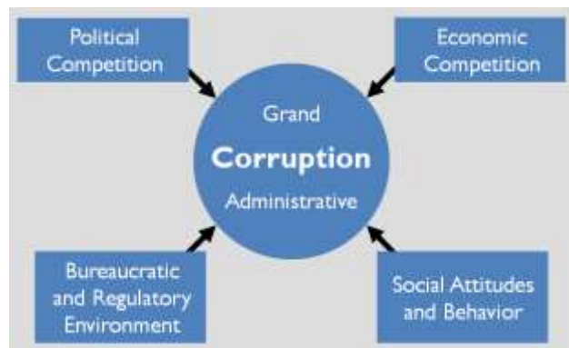
Figure 4. Corruption Dynamics and Access Points for Response (from USAID Anticorruption Strategy)

The sector-based Corruption Diagnostic Guide of USAID's Anticorruption Assessment Handbook can be an instrumental tool for pinpointing corruption vulnerabilities and the need for specific interventions for sectoral program. The Guide currently consists of detailed diagnostic questions for 19 sectors that allow policies, procedures and practices in a particular sector or function of government to be assessed. Questions are also included to examine corruption vulnerabilities and assess the capacity and readiness of civil society organizations, the business community, and the media to contribute to anticorruption efforts. The Diagnostic Guide can be expanded or modified and similar sets of diagnostic questions can be developed for other sectors and function as needed. Often, anticorruption programming in a particular